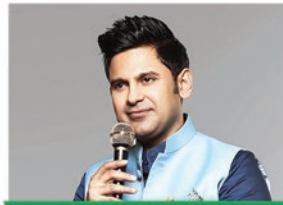
Manoj Muntashir Bollywood Lyricist