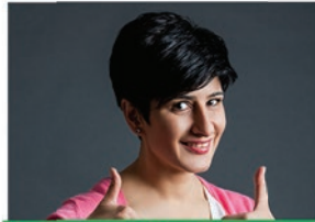
Neeti Palta Stand-up Comedian