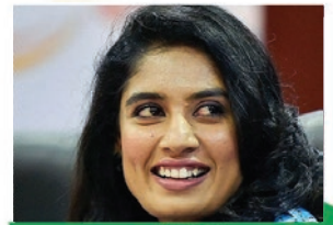
Mithali Raj Indian Cricketer